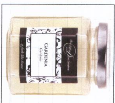
6603 Gardenia Soft Crème

50% of All Sales Benefits the Organization