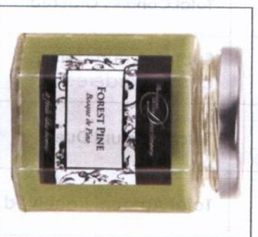
6606 Forest Pine Clover Green