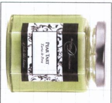
6601 Pear Tart Pear Green