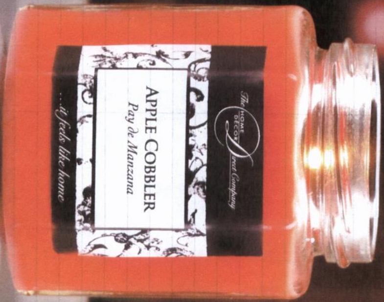
6600 Apple Cobbler - Crimson Red

The HOME DÉCOR Direct Company ...it feels like home