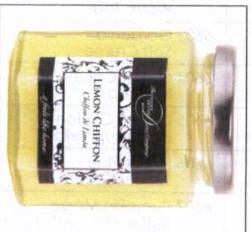
6605 Lemon Chiffon Buttercup Yellow