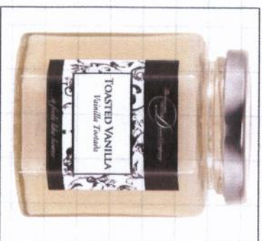
6602 Toasted Vanilla Warm Toast