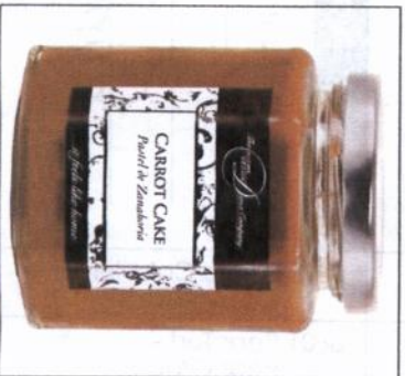
6604 Carrot Cake Nutmeg