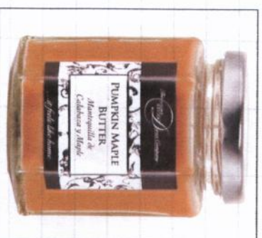
6607 Pumpkin Maple Butter Harvest Spice